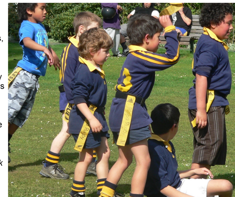
Family Fun Day First Church

May God's grace continue to work in us and through us to bless others whom we meet.