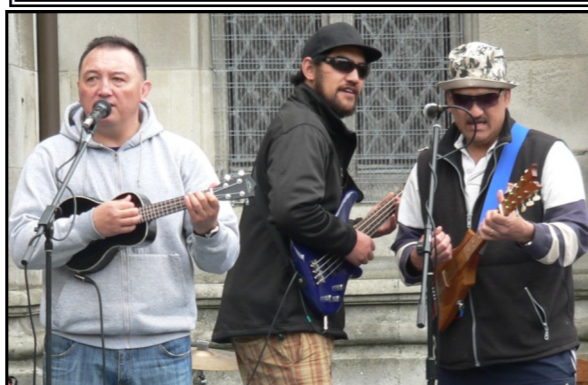
Entertainers at the Family Fun Day

Friends of First Church Committee meeting, Thursday 10 November 2pm, McLean Room